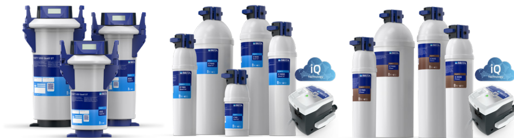
PURITY Quell ST

This is an overview of the complete range of PURITY filtration products, designed specifically for use in vending machines. BRITA Professional has the right solution for you, providing the ideal water for your needs – no matter what the composition of your mains supply.